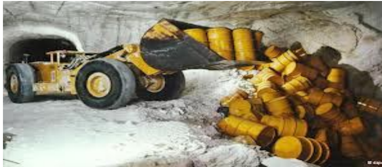
Fig. 3 Transportation of Nuclear waste

The transport of nuclear material or nuclear waste shall not begin without a transport plan approved by the Radiation and Nuclear Safety Authority. However, a transport plan is not required for such nuclear materials or nuclear wastes that have been exempted from a licence for the transport.