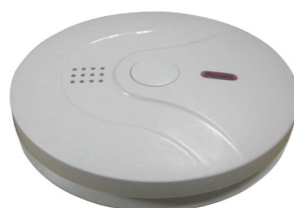
Fig.2. Buzzer Alarm

A buzzer device or system of alarm devices gives an audible or visual alarm signal about a problem or condition.